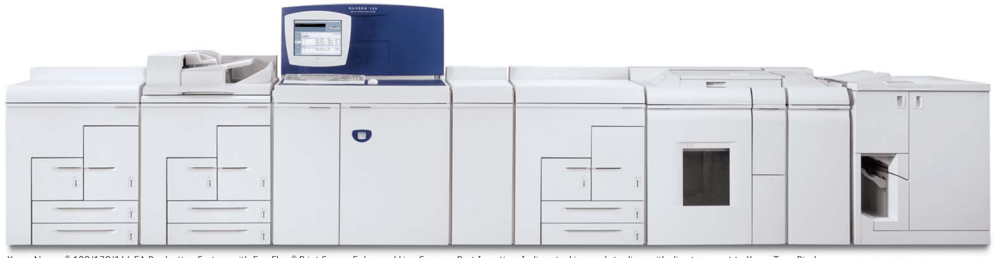
Xerox Nuvera® 100/120/144 EA Production System with FreeFlow® Print Server, Enhanced Line Screens, Post Insertion, In-line stacking and stapling, with direct connect to Xerox Tape Binder